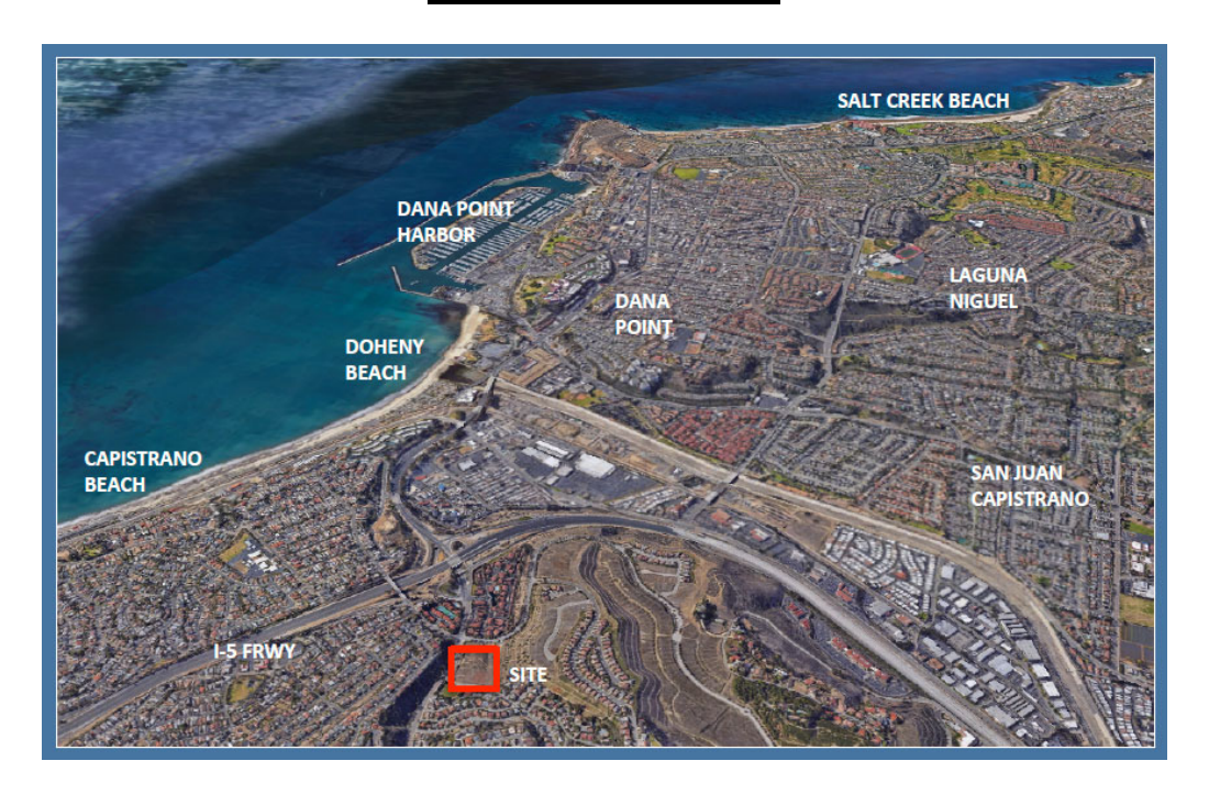
Aerial Photo of the Property